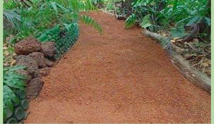
Path with grains of dirt