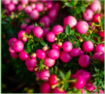
Eat pink berry

Page 7 Matilda couldn't wait for food. She was desperate! So she decided to look for food. As she kept walking, she ended up seeing some bushes with 2 different types of berries on them. Matilda, who was still desperate for food, doesn't know which berry to choose. She has to watch out. One might be poisonous.