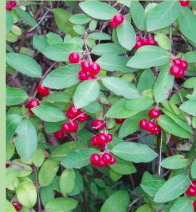
Eat red berry