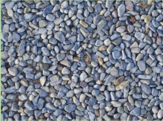
Path with chunks of rocks

Page 12 Matilda slowly put the berries on top of the huge roots of the tree. She was desperate to eat 1 more berry but she still had to find her way out of this wide jungle. Matilda saw 2 different paths. One had small chunks of rocks. The other had grains of dirt.